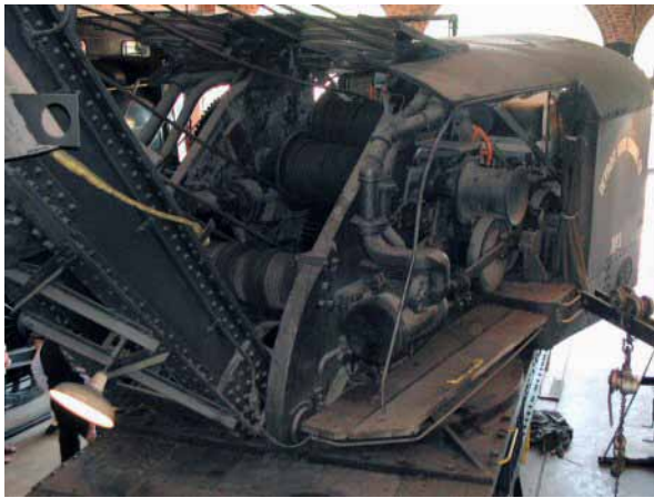
Crane in Greenfield Village's roundhouse during our field trip a few years back.

Deadline for the April Flatwheel is Thursday April 1, 2010.