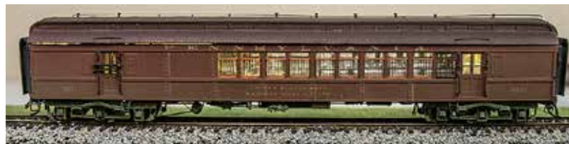
Jim Grell took first place in passenger cars (above), offline structures (cover photo) and favorite train.

Dave Williams claimed first place B/W Model Photo for a night scene on Dave Lawler's layout., The picture and all models are scheduled to be at the June meeting.