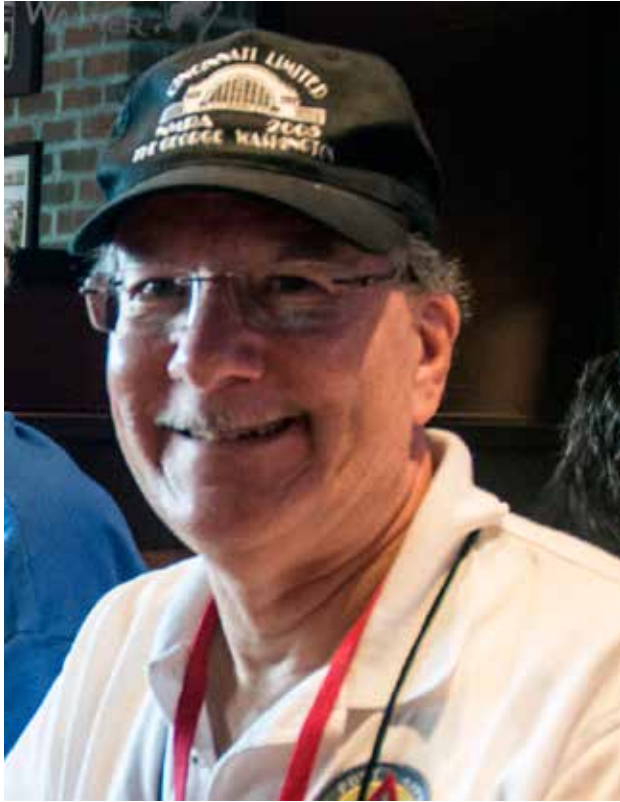
MCR Division 3