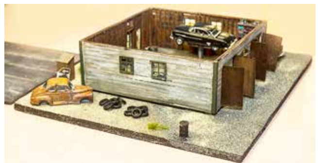
Dave Williams' entry

I normally don't know which entries belong to who at the meetings. I sometimes try later to match descriptions to pictures but that activity is fraught with danger. Fortunately the November contest had a manageable number of entries for me with both contestants showing up at the same time. -editor