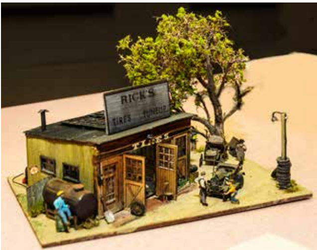
Tom McInerney's entry

Also, remember that the February contest is for Cleveland area railway structures so get busy on that Terminal Tower/CUT model you've always wanted to build. Don't forget the flag on top.