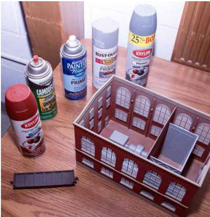
The February clinic featured several clinicians describing their current paint choices for models. While this picture only shows larger aerosol cans, rest assured that much smaller containers were discussed as well.

Yahoo - The Division has a Yahoo group available for members. Send your request to join to dave_wms@sbcglobal.net. It's best to include "Division 4" in the subject line and include your name.