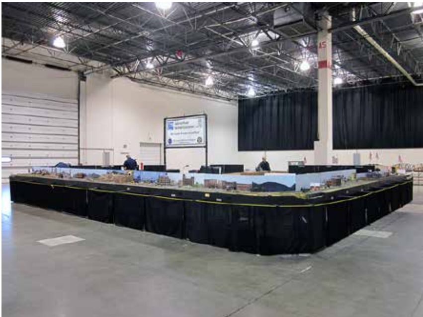
The Division 4 modular layout just before WGH show opening in Novi Michigan.

We're finalizing our module list and configuration for the National Train Show. With Divisions 1 and 5, and Hub Division, we're up to about 95 modules in a 60' x 100' layout. It's going to be an interesting run!