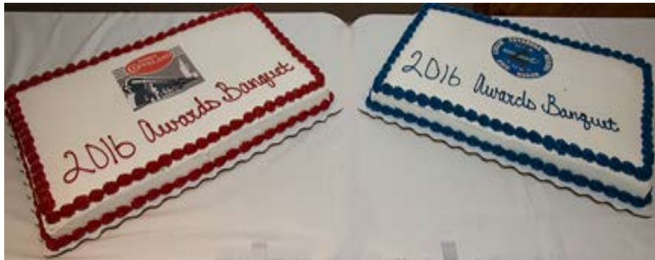
The December Awards Banquet featured these fine cakes - and no shortage of other desserts!

Official newsletter of Division Four, Mid Central Region of the National Model Railroad Association.