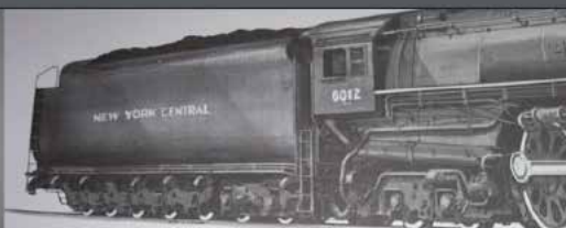
"NIAGARA" TYPE PASSENGER LOCOMOTIVE-CLASS S-14 BUILT FOR THE NEW YORK CENTRAL BY THE AMERICAN LOCOMOTIVE CO. 1944