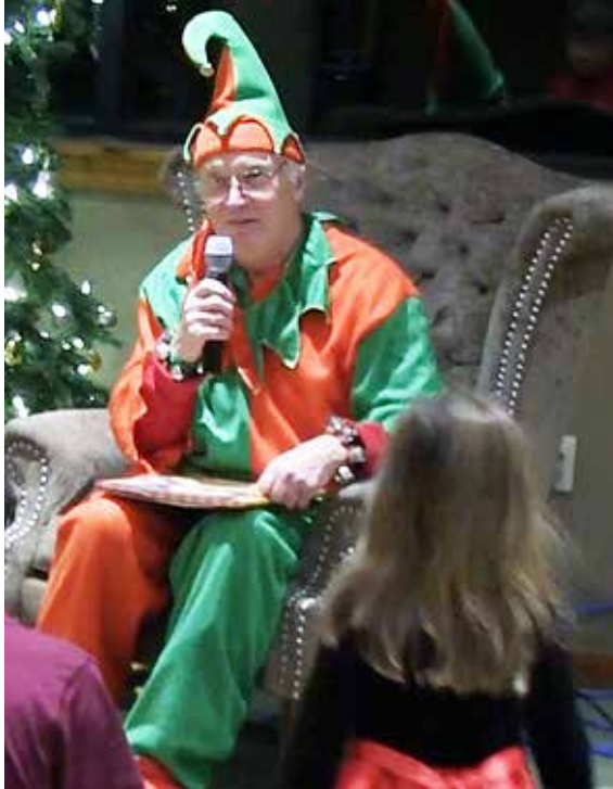
Awards Banquet's Elf on the Shelf.

The Berea Union Depot Taverne has discontinued its discount offer to Division 4. We thank them for their generous support and encourage members to continue patronage of this restaurant. They continue to provide a great place to watch trains while dining.