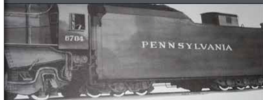
DUAL PURPOSE ENGINE No. 6704 CLASS M1A BUILT FOR THE PENNSYLVANIA RAILROAD BY BALDWIN LOCOMOTIVE WORKS 1890