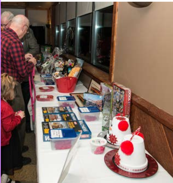
Raffle prizes and ticket placers.